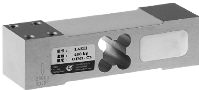
Models L6E3 and L6E3-R1